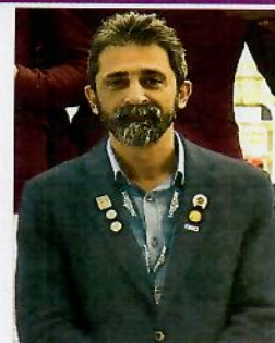
Insert your photo