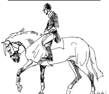
Diagram ii Low, deep and round