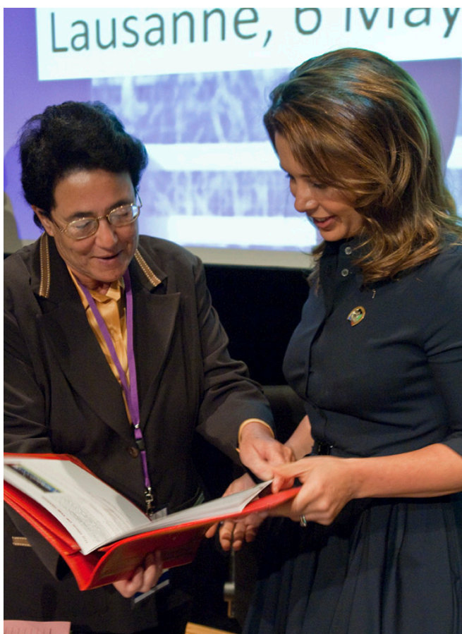
HRH Princess Lalla with HRH Princess Haya in Lausanne last year

A subject that is very important to our sport and which we have been concentrating on for some time now is the international movement of competition horses. I encourage you all to attend the session devoted to this, at which we will make some significant announcements on the direction that we are taking in this area.