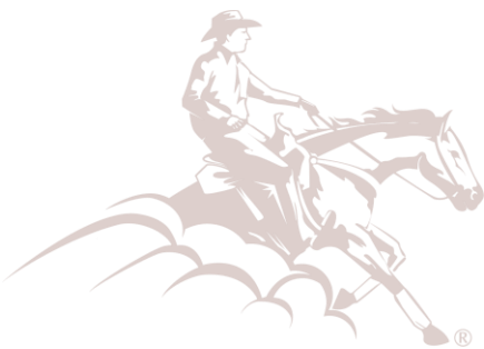
Gary Carpenter NRHA Commissioner