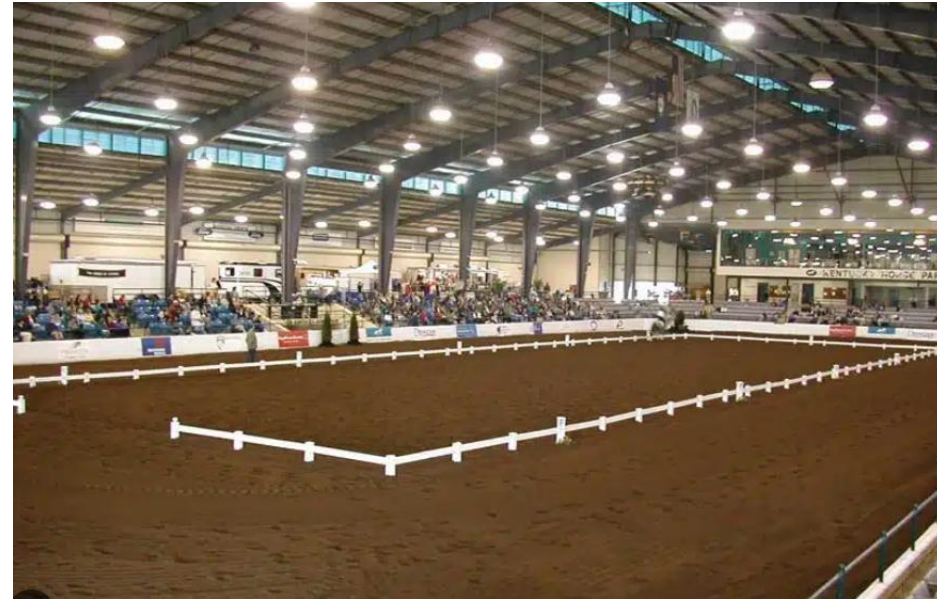
Option of holding Championship indoors?