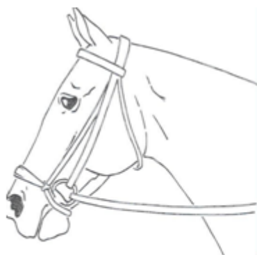
3) Dropped noseband